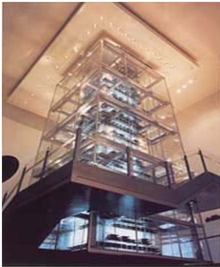
Aureole's 42-foot glass-encased wine tower

* Please note that this event is during and for clients attending the Global Gaming Expo.